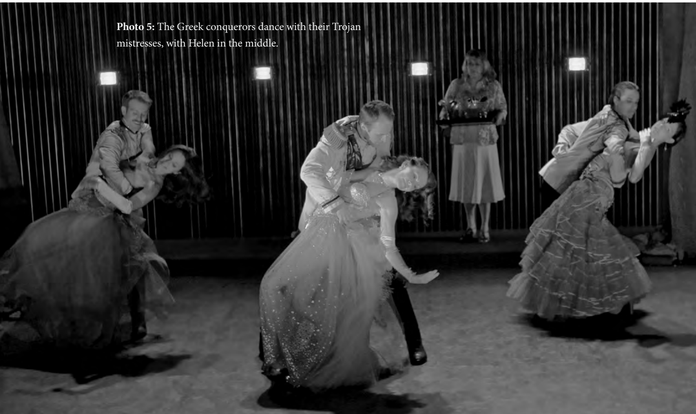
Photo 5: The Greek conquerors dance with their Trojan mistresses, with Helen in the middle.

Talthybius drags Cassandra away. She sings an idiot song as she goes, which is abruptly silenced at some point offstage as Talthybius gags her.